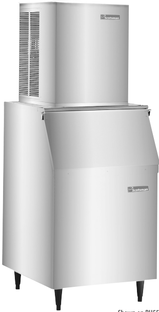
Shown on BH550S-C bin.